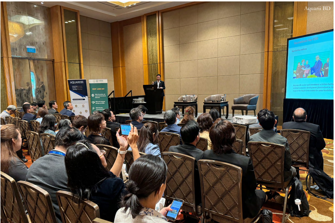
H.E. Hem Vandy, Minister of Industry, Science, Technology & Innovation, delivered a keynote address covering economic, investment, and infrastructure overviews, as well as incentives for Foreign Direct Investment (FDI) in Cambodia.

→ In particular, with the new mandate government comprising younger, better-educated and more progressive-minded leaders and policymakers, Cambodia now offers even more favorable conditions for doing business and investing in the Kingdom.