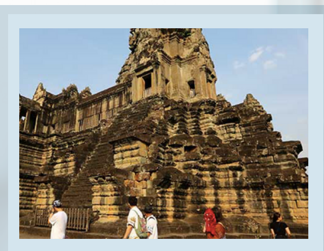
Tourists enjoy Angkor Wat

The Royal Goverment of Cambodia has extended a waiver of monthly payment of all types of taxes, except Value Added Tax (VAT) for another three months from January to March 2023 for hotels, guesthouses and tour agency firms that were listed with the General Department of Taxation (GDT) and have business activities in Siem Reap.